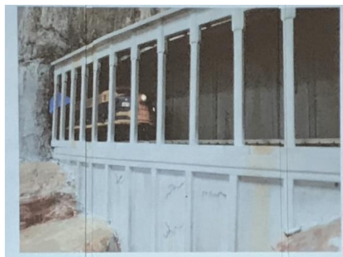
SP modelers are familiar with snow sheds, but this is a rock shed on Jerry Boudreaux's ATSF Pasquinel Subdivision HO scale layout.